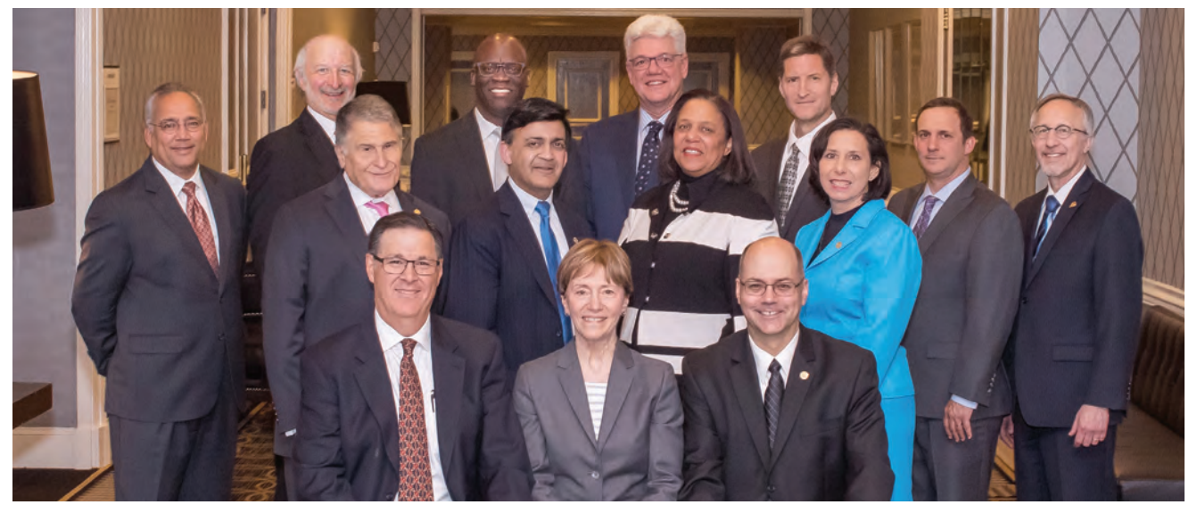
The FSMB 2018-19 Board of Directors

The Federation of State Medical Boards represents a community of dedicated public servants, spread throughout the United States. Their commitment to protecting the public and ensuring the highest standards of medical quality is the key to the successful operation of the nation's medical regulatory system. In this section of our annual report, we acknowledge the work of the many individuals who make up our committees, councils and boards. We thank them for their important contributions.